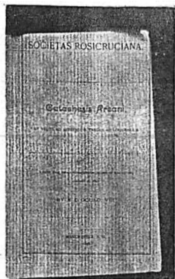
Supplement to Mercury, Vol. 4, No. 5.