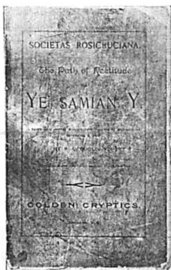
Supplement to Mercury, Vol. 4, No. 12.